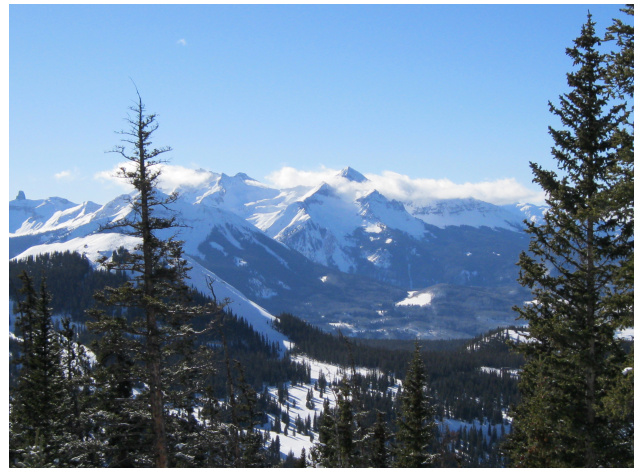
2011 Telluride Mountains IMG_1516